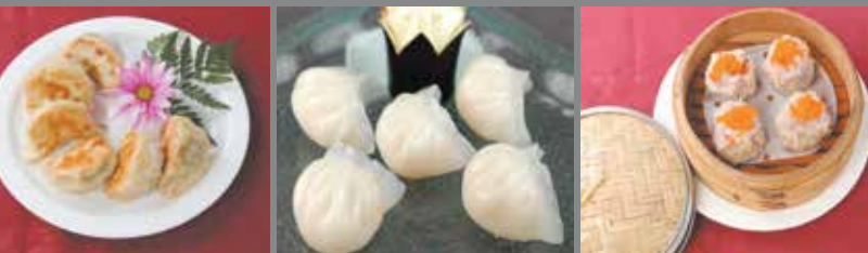
8. Pan Fried Meat Dumplings 12. Haw Gaw 13. Shiu Mar