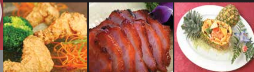
19. Golden Crispy Wings 32. B.B.Q. Pork 38A. Sauteed Chicken served in a Fresh Pineapple Boat