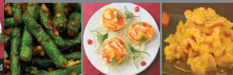
36A. Dry Fried Green Bean 46A. Fresh Mango Chicken 51B. Lemon Chicken HK Style