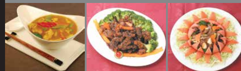
41. Curried Chicken 58. Crispy Beef in Orange Peel Sauce 62. Beef with Broccoli

Indicates Hot & Spicy Indicates Nuts & Peanuts