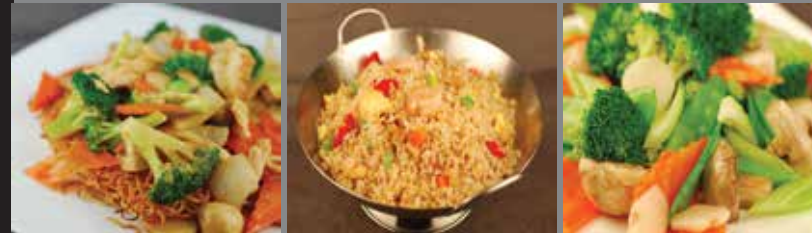
87. Cantonese Chow Mein 91. House Special Fried Rice 74. Chengtu Mixed Vegetables