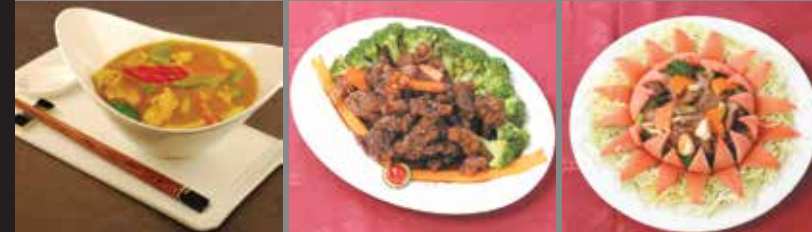
41. Curried Chicken 58. Crispy Beef in Orange Peel Sauce 62. Beef with Broccoli

Indicates Hot & Spicy Indicates Nuts & Peanuts