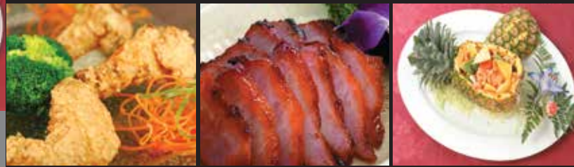
19. Golden Crispy Wings 32. B.B.Q. Pork 38A. Sauteed Chicken served in a Fresh Pineapple Boat