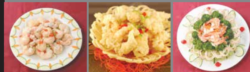
38. Crisp Shrimp w/ Spicy Seasonings 42A. Dry Vancouver Calamari 39. Chicken & Shrimp in a Nest

Indicates Hot & Spicy Indicates Nuts & Peanuts