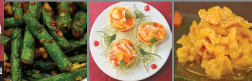
36A. Dry Fried Green Bean 46A. Fresh Mango Chicken 51B. Lemon Chicken HK Style