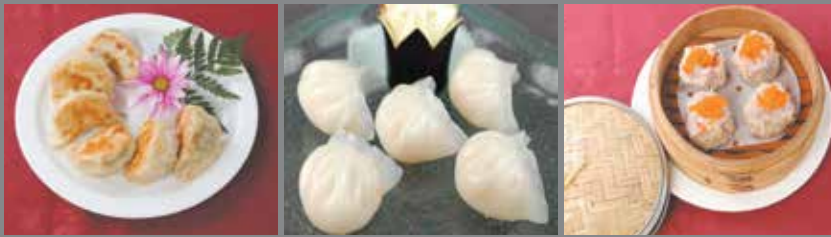
8. Pan Fried Meat Dumplings 12. Haw Gaw 13. Shiu Mar