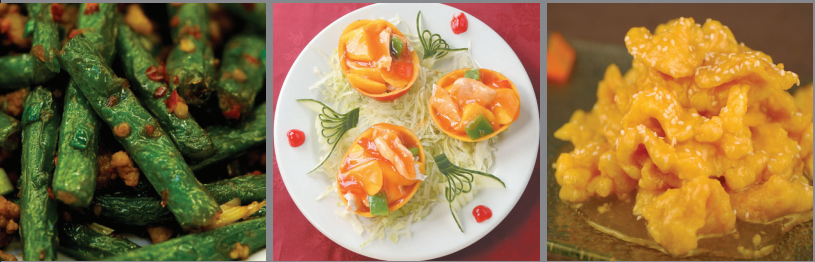
36A. Dry Fried Green Bean 46A. Fresh Mango Chicken 51B. Lemon Chicken H K Style