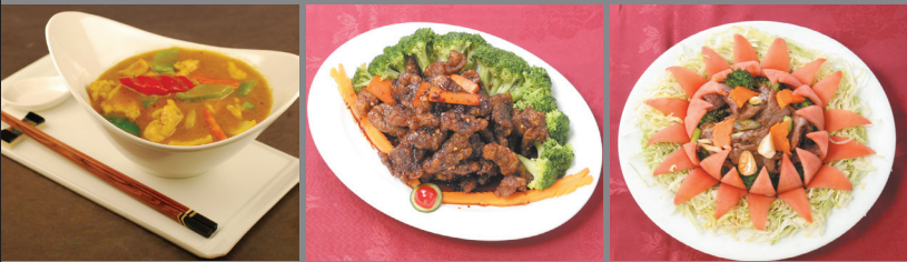
41. Curried Chicken 58. Crispy Beef in Orange Peel Sauce 62. Beef with Broccoli

🔥 Indicates Hot & Spicy 🍢 Indicates Nuts & Peanuts