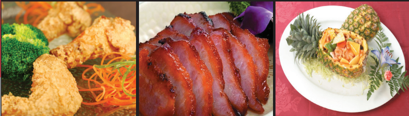
19. Golden Crispy Wings 32. B.B.Q. Pork 38A. Sautéed Chicken served in a Fresh Pineapple Boat