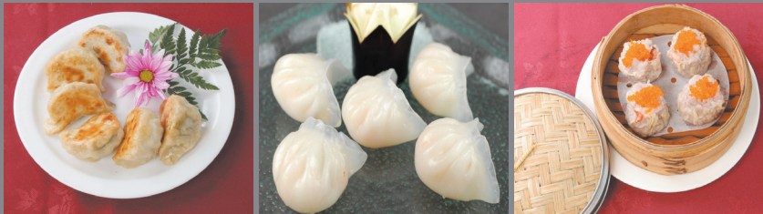
8. Pan Fried Meat Dumplings 12. Haw Gaw 13. Shiu Mar