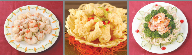
38. Crisp Shrimp w/ Spicy Seasonings 42A. Dry Vancouver Calamari 39. Chicken & Shrimp in a Nest

🔥 Indicates Hot & Spicy 🍢 Indicates Nuts & Peanuts