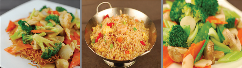
87.Cantonese Chow Mein 91. House Special Fried Rice 74.Chengtou Mixed Vegetables